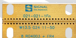
1" Grounded Coplanar Waveguide (GCPWG) on 8 mil RO4003 with FR-4 Backer