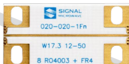
1" Microstrip on 8 mil RO4003 with FR-4

Test board options and test board construction showing no bottom ground.