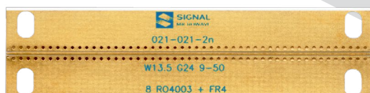
2" Grounded Coplanar Waveguide (GCPWG) on 8 mil RO4003 with FR-4 Backer