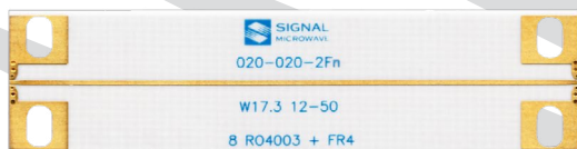
2" Microstrip on 8 mil RO4003 with FR-4