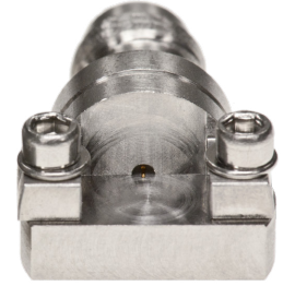
Standard Profile ELF67-002