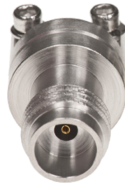
Common Interface ELF67