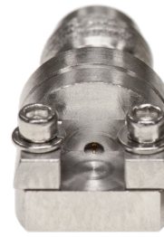
Narrow Profile ELF67-001