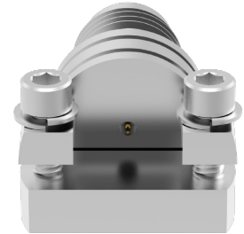
Standard Profile ELF50-002