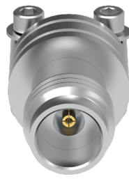
Common Interface ELF50