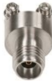
Common Interface ELF40