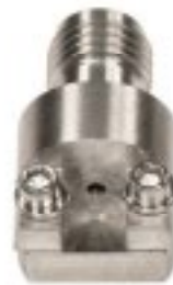
Narrow Profile ELF40-001