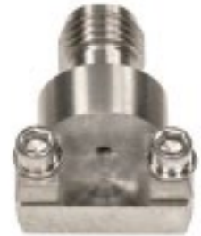
Standard Profile ELF40-002